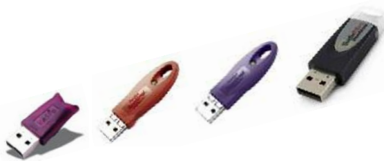
USB Security Key

To use a purchased copy of DesignMerge Pro, you must attach the provided hardware Security Key. Upon purchasing DesignMerge Pro, you should receive a USB Security Key that looks like one of the keys pictured below: