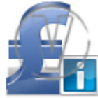
Sign Pound - Blue Information.png