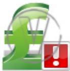
Sign Pound - Green Error.png