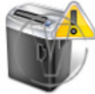
Paper Shredder Warning.png