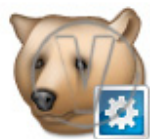
Bear Market Configuration.png