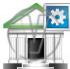
Bank Branch Configuration.png