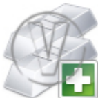
Silver Bars Add.png