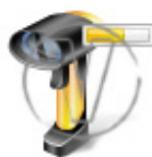
Barcode Scanner Progress.png