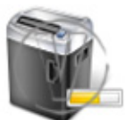
Paper Shredder Progress.png