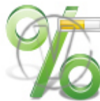
Sign Percentage - Green Progress.png