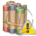
Coin Rolls Warning.png