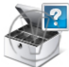
Money Drawer Help.png