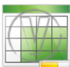
Spread Sheet Green Progress.png