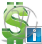
Sign Dollar - Green Information.png