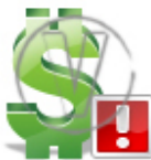
Sign Dollar - Green Error.png