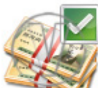
Money Yen Stack Check.png