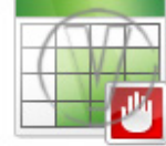
Spread Sheet Green Stop.png