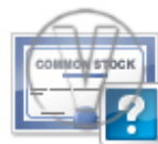
Stock Certificate Help.png