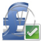
Sign Pound - Blue Check.png