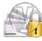
Money Pound Singles Security.png