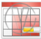
Spread Sheet Red Progress.png