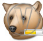
Bear Market Progress.png