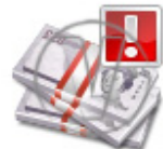
Money Pound Stack Error.png