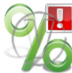
Sign Percentage - Green Error.png