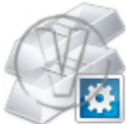
Silver Bars Configuration.png