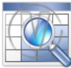
Spread Sheet Blue Search.png