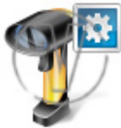
Barcode Scanner Configuration.png