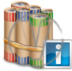
Coin Rolls Information.png