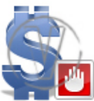
Sign Dollar - Blue Stop.png