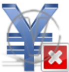
Sign Yen - Blue Delete.png