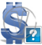
Sign Dollar - Blue Help.png