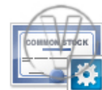
Stock Certificate Configuration.png