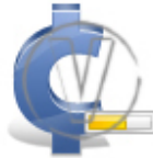
Sign Cent - Blue Progress.png