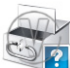
Safety Deposit Box Help.png