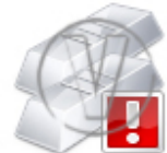
Silver Bars Error.png