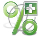
Sign Percentage - Green Add.png