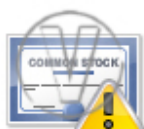
Stock Certificate Warning.png