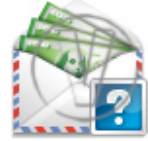
Petty Cash Help.png