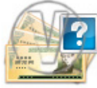
Money Yen Singles Help.png