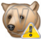
Bear Market Warning.png