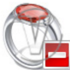
Assets Personal Restricted.png