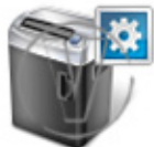
Paper Shredder Configuration.png