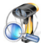
Barcode Scanner Search.png