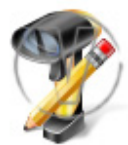
Barcode Scanner Edit.png