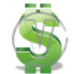
Sign Dollar - Green.png