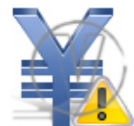
Sign Yen - Blue Warning.png