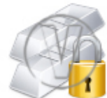
Silver Bars Security.png