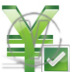
Sign Yen - Green Check.png