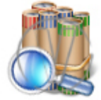
Coin Rolls Search.png