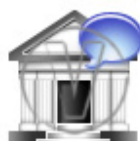
Bank Head Office Chat.png