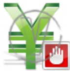
Sign Yen - Green Stop.png