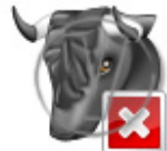
Bull Market Delete.png