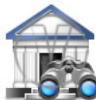
Bank Regional Office Find.png