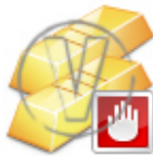
Gold Bars Stop.png