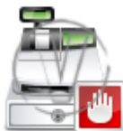
Cash Register Stop.png