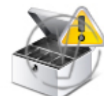
Money Drawer Warning.png