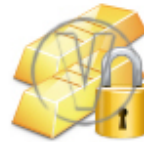
Gold Bars Security.png