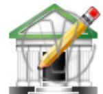
Bank Branch Edit.png