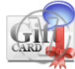
Gift Card Chat.png