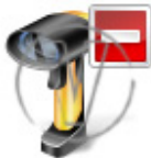
Barcode Scanner Restricted.png