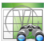
Spread Sheet Green Find.png