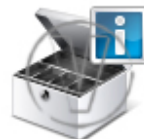
Money Drawer Information.png