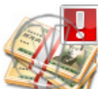
Money Yen Stack Error.png