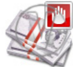
Money Pound Stack Stop.png