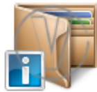
Personal Finances Information.png