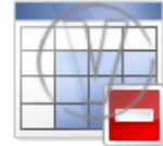
Spread Sheet Blue Restricted.png