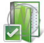
General Ledger Check.png