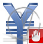
Sign Yen - Blue Stop.png