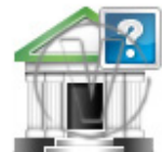
Bank Branch Help.png