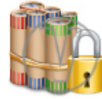
Coin Rolls Security.png