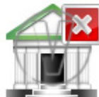
Bank Branch Delete.png