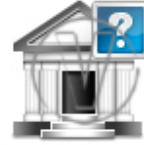
Bank Head Office Help.png