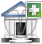
Bank Regional Office Add.png