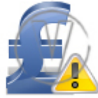
Sign Pound - Blue Warning.png