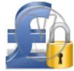
Sign Pound - Blue Security.png