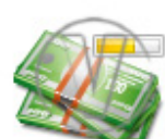
Money USD Stack Progress.png