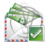
Petty Cash Check.png