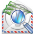
Petty Cash Search.png