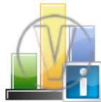
Chart Bar Information.png