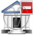
Bank Regional Office Restricted.png