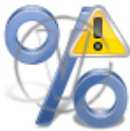
Sign Percentage - Blue Warning.png