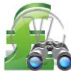
Sign Pound - Green Find.png