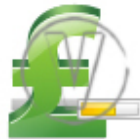
Sign Pound - Green Progress.png