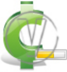
Sign Cent - Green Progress.png