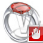
Assets Personal Stop.png