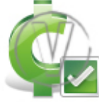
Sign Cent - Green Check.png