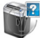
Paper Shredder Help.png