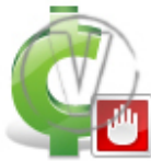
Sign Cent - Green Stop.png