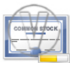
Stock Certificate Progress.png