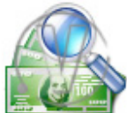
Money USD Singles Search.png