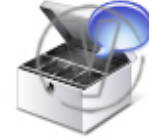
Money Drawer Chat.png