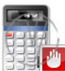
Calculator Accounting Stop.png