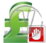
Sign Pound - Green Stop.png