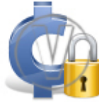
Sign Cent - Blue Security.png