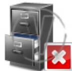
Accounting Records Delete.png