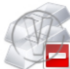
Silver Bars Restricted.png