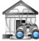
Bank Head Office Find.png