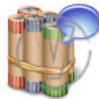
Coin Rolls Chat.png