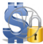
Sign Dollar - Blue Security.png