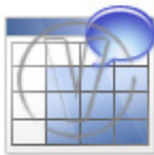
Spread Sheet Blue Chat.png