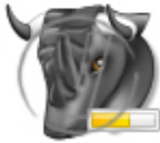
Bull Market Progress.png