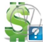
Sign Dollar - Green Help.png