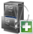
Accounting Records Add.png