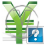
Sign Yen - Green Help.png