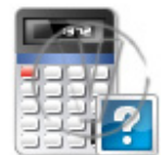
Calculator Accounting Help.png