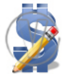
Sign Dollar - Blue Edit.png