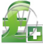
Sign Pound - Green Add.png