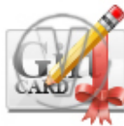
Gift Card Edit.png