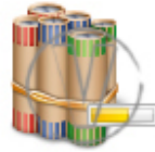
Coin Rolls Progress.png