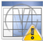
Spread Sheet Blue Warning.png