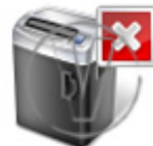
Paper Shredder Delete.png