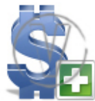
Sign Dollar - Blue Add.png