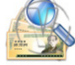
Money Yen Singles Search.png