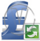
Sign Pound - Blue Refresh.png