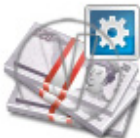
Money Pound Stack Configuration.png