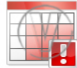
Spread Sheet Red Error.png