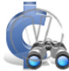
Sign Cent - Blue Find.png