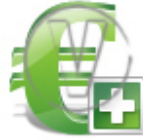
Sign Euro - Green Add.png