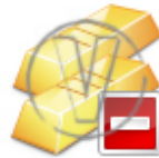
Gold Bars Restricted.png