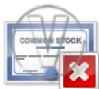
Stock Certificate Delete.png