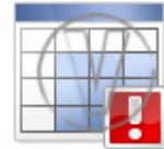
Spread Sheet Blue Error.png