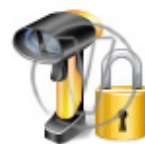
Barcode Scanner Security.png