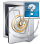
Bank Vault Help.png