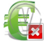
Sign Euro - Green Delete.png