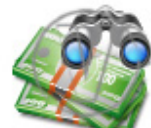
Money USD Stack Find.png