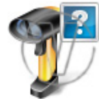
Barcode Scanner Help.png