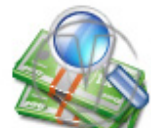
Money USD Stack Search.png