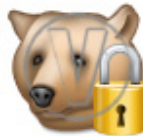
Bear Market Security.png