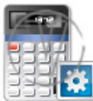
Calculator Accounting Configuration.png