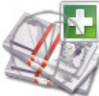
Money Pound Stack Add.png