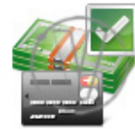
Settlement Method Check.png