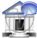
Bank Regional Office Chat.png