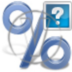
Sign Percentage - Blue Help.png