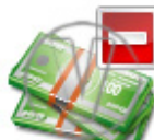
Money USD Stack Restricted.png