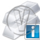
Silver Bars Information.png