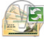
Money Yen Singles Refresh.png