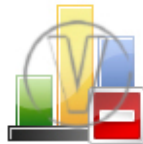
Chart Bar Restricted.png