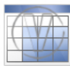
Spread Sheet Blue.png