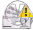
Money Pound Singles Warning.png