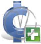
Sign Cent - Blue Add.png