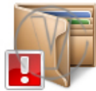
Personal Finances Error.png