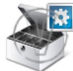
Money Drawer Configuration.png