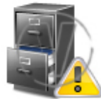
Accounting Records Warning.png