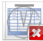
Purchase Order Delete.png