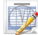
Purchase Order Edit.png