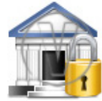
Bank Regional Office Security.png