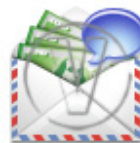
Petty Cash Chat.png