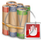
Coin Rolls Stop.png