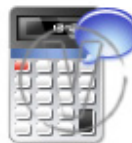
Calculator Accounting Chat.png