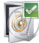
Bank Vault Check.png