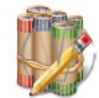
Coin Rolls Edit.png