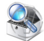
Money Drawer Search.png