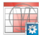
Spread Sheet Red Configuration.png