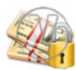
Money Yen Stack Security.png