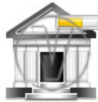
Bank Head Office Progress.png