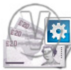
Money Pound Singles Configuration.png