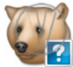
Bear Market Help.png