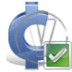
Sign Cent - Blue Check.png