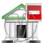
Bank Branch Restricted.png