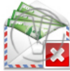
Petty Cash Delete.png