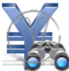
Sign Yen - Blue Find.png