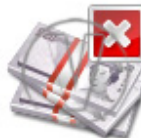
Money Pound Stack Delete.png