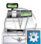
Cash Register Configuration.png