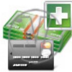
Settlement Method Add.png