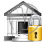
Bank Head Office Security.png