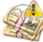
Money Yen Stack Warning.png