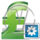
Sign Pound - Green Configuration.png