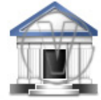
Bank Regional Office.png