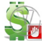
Sign Dollar - Green Stop.png