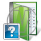
General Ledger Help.png