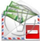
Petty Cash Restricted.png