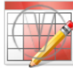
Spread Sheet Red Edit.png