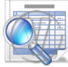
Purchase Order Search.png