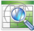
Spread Sheet Green Search.png