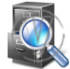
Accounting Records Search.png