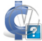
Sign Cent - Blue Help.png