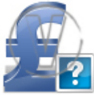
Sign Pound - Blue Help.png