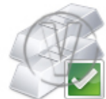
Silver Bars Check.png