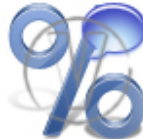
Sign Percentage - Blue Chat.png