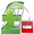
Sign Pound - Green Restricted.png