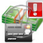
Settlement Method Error.png