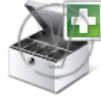
Money Drawer Add.png