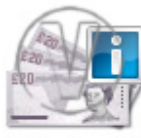
Money Pound Singles Information.png