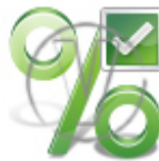
Sign Percentage - Green Check.png