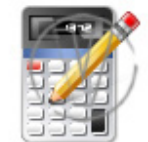
Calculator Accounting Edit.png