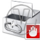
Safety Deposit Box Stop.png