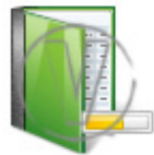
General Ledger Progress.png