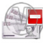
Money Pound Singles Restricted.png