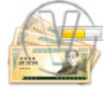
Money Yen Singles Progress.png