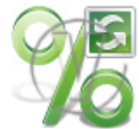
Sign Percentage - Green Refresh.png