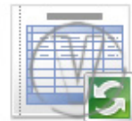
Purchase Order Refresh.png