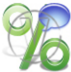
Sign Percentage - Green Chat.png