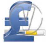
Sign Pound - Blue Progress.png