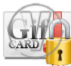
Gift Card Security.png