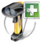
Barcode Scanner Add.png