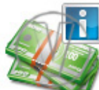
Money USD Stack Information.png