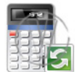
Calculator Accounting Refresh.png