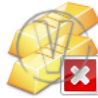
Gold Bars Delete.png