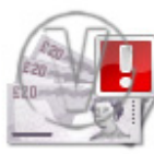
Money Pound Singles Error.png