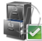
Accounting Records Check.png