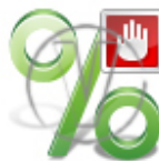
Sign Percentage - Green Stop.png