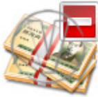
Money Yen Stack Restricted.png