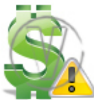
Sign Dollar - Green Warning.png