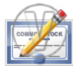
Stock Certificate Edit.png