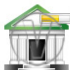
Bank Branch Progress.png