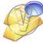
Gold Bars Chat.png