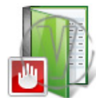
General Ledger Stop.png