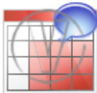
Spread Sheet Red Chat.png