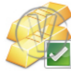
Gold Bars Check.png