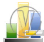
Chart Bar Progress.png