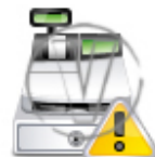
Cash Register Warning.png