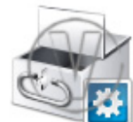
Safety Deposit Box Configuration.png