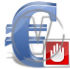
Sign Euro - Blue Stop.png