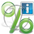
Sign Percentage - Green Information.png