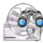
Money Pound Singles Find.png