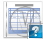
Purchase Order Help.png