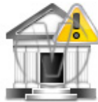
Bank Head Office Warning.png