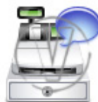
Cash Register Chat.png