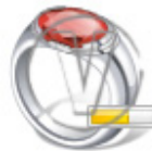
Assets Personal Progress.png