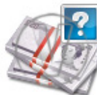
Money Pound Stack Help.png