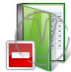
General Ledger Restricted.png