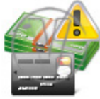
Settlement Method Warning.png