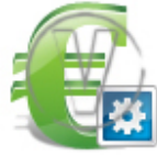
Sign Euro - Green Configuration.png