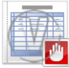
Purchase Order Stop.png