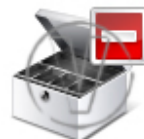
Money Drawer Restricted.png