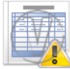
Purchase Order Warning.png