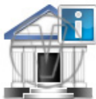
Bank Regional Office Information.png