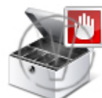
Money Drawer Stop.png