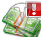
Money USD Stack Error.png