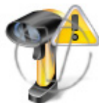
Barcode Scanner Warning.png