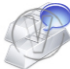
Silver Bars Chat.png