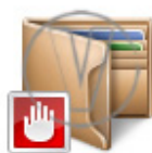
Personal Finances Stop.png