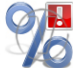
Sign Percentage - Blue Error.png