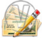
Money Yen Singles Edit.png