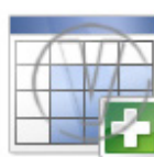
Spread Sheet Blue Add.png