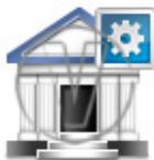
Bank Regional Office Configuration.png