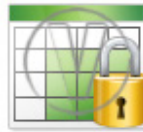
Spread Sheet Green Security.png