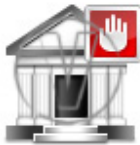
Bank Head Office Stop.png