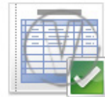
Purchase Order Check.png