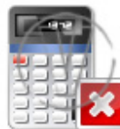
Calculator Accounting Delete.png