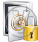
Bank Vault Security.png