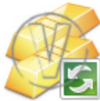
Gold Bars Refresh.png