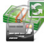
Settlement Method Refresh.png