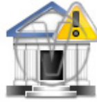
Bank Regional Office Warning.png