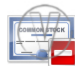
Stock Certificate Restricted.png