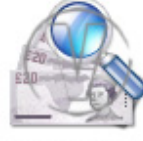
Money Pound Singles Search.png