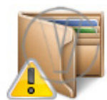
Personal Finances Warning.png