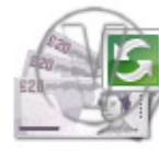
Money Pound Singles Refresh.png