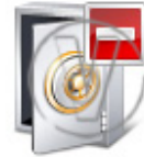
Bank Vault Restricted.png