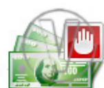
Money USD Singles Stop.png