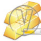
Gold Bars Progress.png