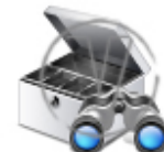
Money Drawer Find.png