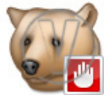
Bear Market Stop.png