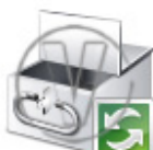
Safety Deposit Box Refresh.png