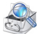
Safety Deposit Box Search.png