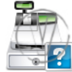
Cash Register Help.png