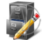
Accounting Records Edit.png