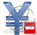
Sign Yen - Blue Restricted.png