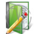
General Ledger Edit.png