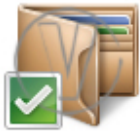
Personal Finances Check.png