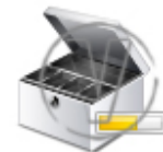
Money Drawer Progress.png