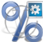
Sign Percentage - Blue Configuration.p...