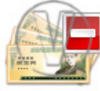
Money Yen Singles Restricted.png