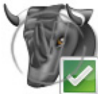
Bull Market Check.png