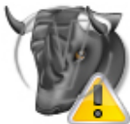
Bull Market Warning.png