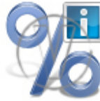
Sign Percentage - Blue Information.png