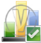
Chart Bar Check.png