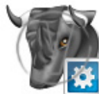
Bull Market Configuration.png