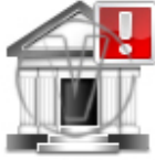
Bank Head Office Error.png