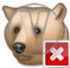
Bear Market Delete.png