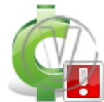
Sign Cent - Green Error.png