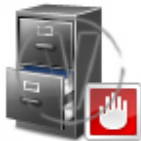
Accounting Records Stop.png