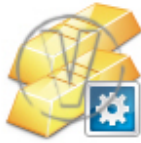
Gold Bars Configuration.png