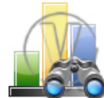
Chart Bar Find.png