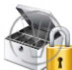
Money Drawer Security.png