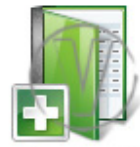
General Ledger Add.png