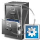
Accounting Records Configuration.png