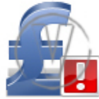
Sign Pound - Blue Error.png