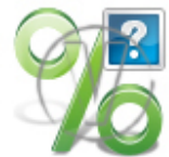
Sign Percentage - Green Help.png