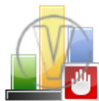
Chart Bar Stop.png