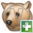
Bear Market Add.png