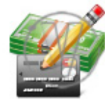
Settlement Method Edit.png