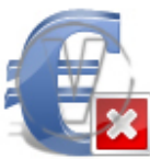
Sign Euro - Blue Delete.png