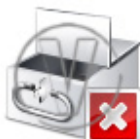
Safety Deposit Box Delete.png