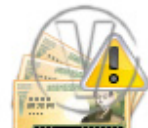
Money Yen Singles Warning.png