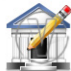
Bank Regional Office Edit.png