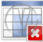
Spread Sheet Blue Delete.png