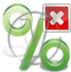
Sign Percentage - Green Delete.png