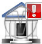
Bank Regional Office Error.png