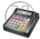
Credit Card Swiper.png