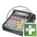
Credit Card Swiper Add.png