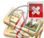
Money Yen Stack Delete.png