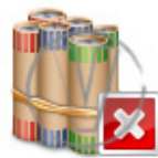
Coin Rolls Delete.png