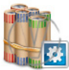
Coin Rolls Configuration.png