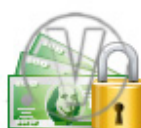
Money USD Singles Security.png