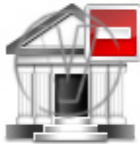
Bank Head Office Restricted.png