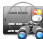
Credit Card Black Find.png