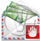
Petty Cash Stop.png