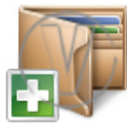
Personal Finances Add.png