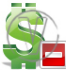
Sign Dollar - Green Restricted.png