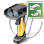
Barcode Scanner Refresh.png