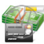
Settlement Method Progress.png