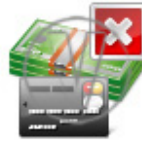
Settlement Method Delete.png