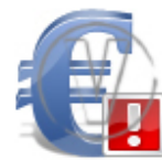
Sign Euro - Blue Error.png