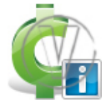
Sign Cent - Green Information.png