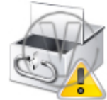
Safety Deposit Box Warning.png