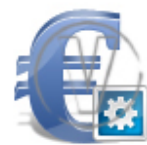
Sign Euro - Blue Configuration.png