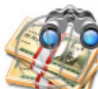
Money Yen Stack Find.png