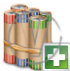
Coin Rolls Add.png