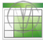
Spread Sheet Green.png