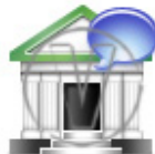
Bank Branch Chat.png