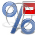
Sign Percentage - Blue Restricted.png