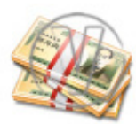
Money Yen Stack.png