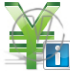
Sign Yen - Green Information.png