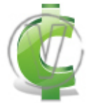
Sign Cent - Green.png