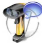
Barcode Scanner Chat.png