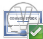
Stock Certificate Check.png