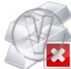
Silver Bars Delete.png