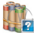
Coin Rolls Help.png