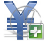
Sign Yen - Blue Add.png