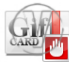
Gift Card Stop.png