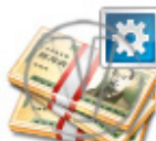
Money Yen Stack Configuration.png