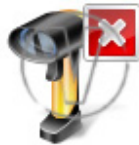
Barcode Scanner Delete.png