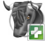
Bull Market Add.png