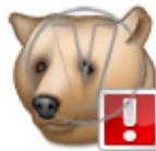
Bear Market Error.png