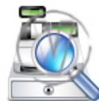
Cash Register Search.png