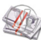
Money Pound Stack.png