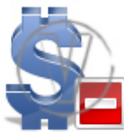
Sign Dollar - Blue Restricted.png