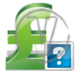
Sign Pound - Green Help.png