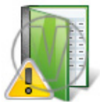
General Ledger Warning.png