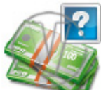
Money USD Stack Help.png