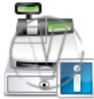
Cash Register Information.png