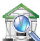
Bank Branch Search.png