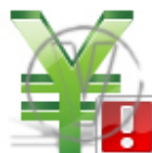
Sign Yen - Green Error.png