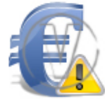
Sign Euro - Blue Warning.png