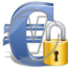
Sign Euro - Blue Security.png