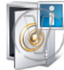
Bank Vault Information.png