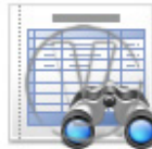
Purchase Order Find.png