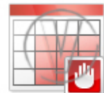
Spread Sheet Red Stop.png