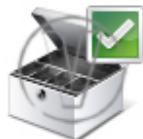
Money Drawer Check.png