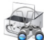
Safety Deposit Box Find.png