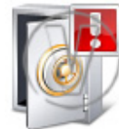
Bank Vault Error.png