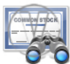
Stock Certificate Find.png