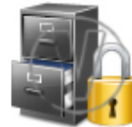
Accounting Records Security.png