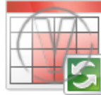
Spread Sheet Red Refresh.png