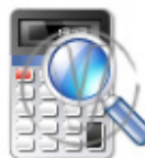
Calculator Accounting Search.png