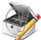
Money Drawer Edit.png