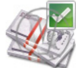
Money Pound Stack Check.png