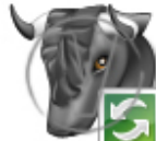
Bull Market Refresh.png