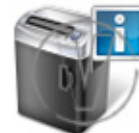
Paper Shredder Information.png