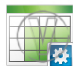
Spread Sheet Green Configuration.png