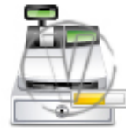
Cash Register Progress.png