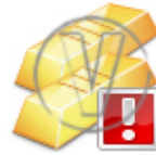
Gold Bars Error.png