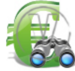
Sign Euro - Green Find.png