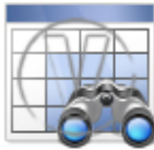
Spread Sheet Blue Find.png