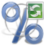
Sign Percentage - Blue Refresh.png