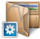
Personal Finances Configuration.png