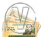
Money Yen Singles.png