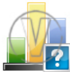
Chart Bar Help.png