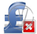
Sign Pound - Blue Delete.png