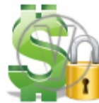
Sign Dollar - Green Security.png