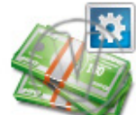
Money USD Stack Configuration.png