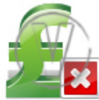
Sign Pound - Green Delete.png