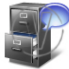
Accounting Records Chat.png