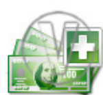
Money USD Singles Add.png