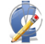
Sign Cent - Blue Edit.png