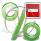
Sign Percentage - Green Restricted.png