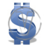
Sign Dollar - Blue.png