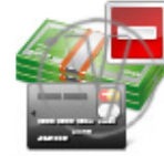
Settlement Method Restricted.png