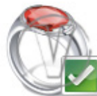
Assets Personal Check.png