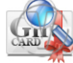
Gift Card Search.png