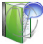
General Ledger Chat.png