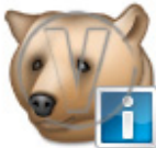
Bear Market Information.png