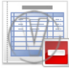
Purchase Order Restricted.png