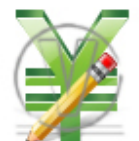
Sign Yen - Green Edit.png