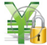
Sign Yen - Green Security.png