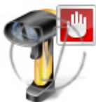
Barcode Scanner Stop.png