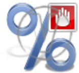
Sign Percentage - Blue Stop.png