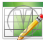
Spread Sheet Green Edit.png