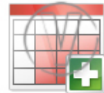
Spread Sheet Red Add.png