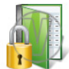
General Ledger Security.png