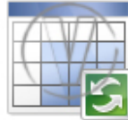
Spread Sheet Blue Refresh.png