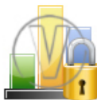
Chart Bar Security.png