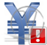
Sign Yen - Blue Error.png