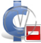
Sign Cent - Blue Restricted.png