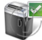
Paper Shredder Check.png