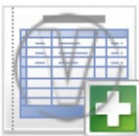
Purchase Order Add.png