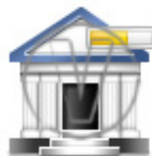
Bank Regional Office Progress.png