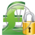
Sign Pound - Green Security.png