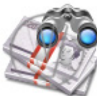
Money Pound Stack Find.png