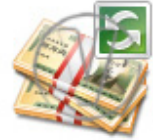
Money Yen Stack Refresh.png