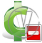
Sign Cent - Green Restricted.png