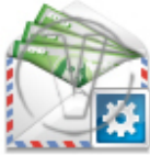
Petty Cash Configuration.png