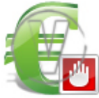
Sign Euro - Green Stop.png