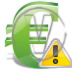
Sign Euro - Green Warning.png