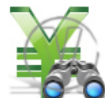
Sign Yen - Green Find.png