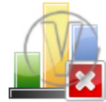
Chart Bar Delete.png