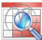
Spread Sheet Red Search.png