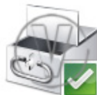
Safety Deposit Box Check.png