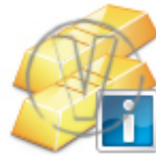
Gold Bars Information.png