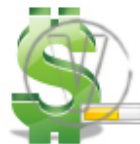
Sign Dollar - Green Progress.png