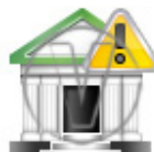
Bank Branch Warning.png