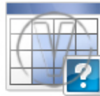
Spread Sheet Blue Help.png