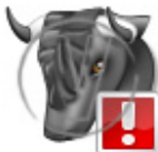
Bull Market Error.png