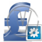
Sign Pound - Blue Configuration.png