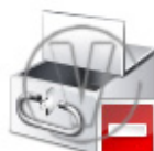
Safety Deposit Box Restricted.png