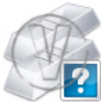
Silver Bars Help.png