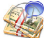
Money Yen Stack Chat.png