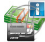
Settlement Method Information.png