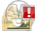
Money Yen Singles Error.png