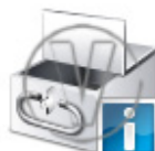
Safety Deposit Box Information.png