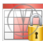
Spread Sheet Red Security.png