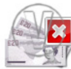
Money Pound Singles Delete.png