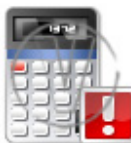
Calculator Accounting Error.png