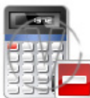
Calculator Accounting Restricted.png