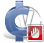
Sign Cent - Blue Stop.png