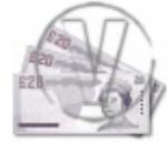
Money Pound Singles.png