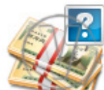
Money Yen Stack Help.png