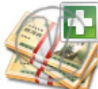
Money Yen Stack Add.png