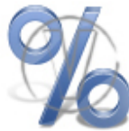
Sign Percentage - Blue.png