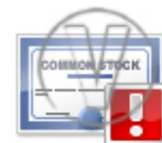
Stock Certificate Error.png