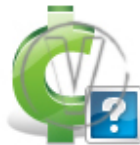
Sign Cent - Green Help.png