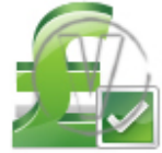
Sign Pound - Green Check.png