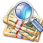
Money Yen Stack Search.png