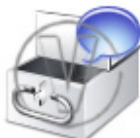
Safety Deposit Box Chat.png