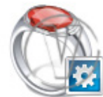
Assets Personal Configuration.png