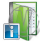
General Ledger Information.png