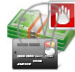
Settlement Method Stop.png