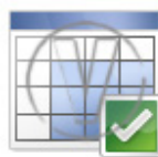
Spread Sheet Blue Check.png