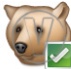
Bear Market Check.png