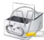
Safety Deposit Box Progress.png