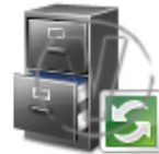
Accounting Records Refresh.png