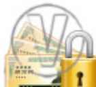
Money Yen Singles Security.png