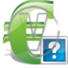
Sign Euro - Green Help.png