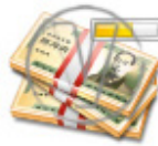
Money Yen Stack Progress.png