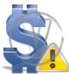
Sign Dollar - Blue Warning.png