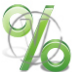
Sign Percentage - Green.png