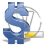
Sign Dollar - Blue Progress.png