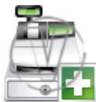
Cash Register Add.png