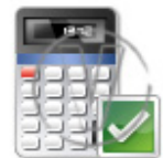
Calculator Accounting Check.png