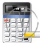
Calculator Accounting Progress.png