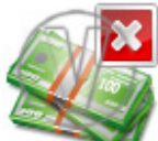
Money USD Stack Delete.png