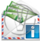
Petty Cash Information.png