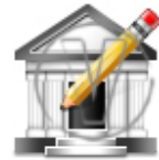
Bank Head Office Edit.png