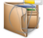
Personal Finances Progress.png