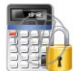
Calculator Accounting Security.png