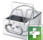
Safety Deposit Box Add.png