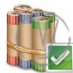
Coin Rolls Check.png