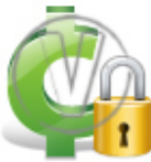
Sign Cent - Green Security.png