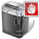
Paper Shredder Stop.png