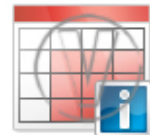
Spread Sheet Red Information.png