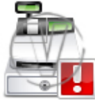
Cash Register Error.png