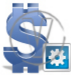
Sign Dollar - Blue Configuration.png