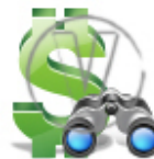
Sign Dollar - Green Find.png