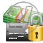
Settlement Method Security.png