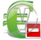
Sign Euro - Green Restricted.png