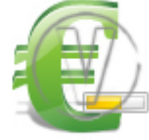
Sign Euro - Green Progress.png