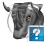
Bull Market Help.png