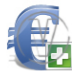
Sign Euro - Blue Add.png