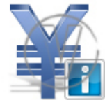
Sign Yen - Blue Information.png