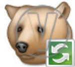
Bear Market Refresh.png