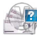
Money Pound Singles Help.png