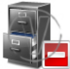
Accounting Records Restricted.png