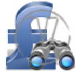
Sign Pound - Blue Find.png