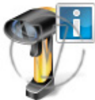
Barcode Scanner Information.png