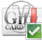
Gift Card Check.png