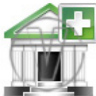
Bank Branch Add.png