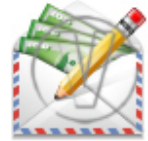
Petty Cash Edit.png