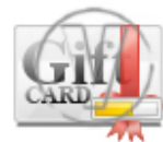
Gift Card Progress.png