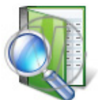
General Ledger Search.png