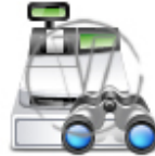
Cash Register Find.png