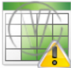
Spread Sheet Green Warning.png