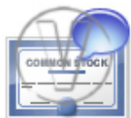
Stock Certificate Chat.png