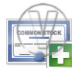
Stock Certificate Add.png