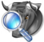
Bull Market Search.png