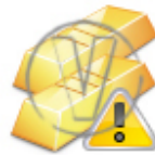
Gold Bars Warning.png