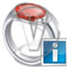
Assets Personal Information.png