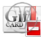
Gift Card Restricted.png