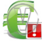
Sign Euro - Green Error.png