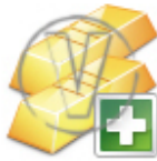
Gold Bars Add.png