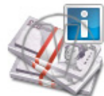
Money Pound Stack Information.png