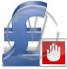
Sign Pound - Blue Stop.png