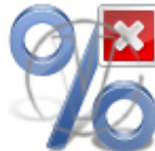
Sign Percentage - Blue Delete.png