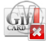
Gift Card Delete.png