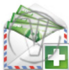
Petty Cash Add.png