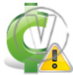
Sign Cent - Green Warning.png