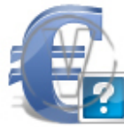
Sign Euro - Blue Help.png