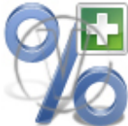
Sign Percentage - Blue Add.png