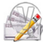
Money Pound Singles Edit.png