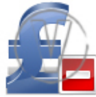
Sign Pound - Blue Restricted.png