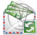
Petty Cash Refresh.png