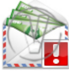
Petty Cash Error.png