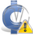
Sign Cent - Blue Warning.png