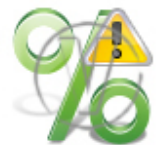
Sign Percentage - Green Warning.png