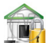
Bank Branch Security.png