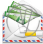
Petty Cash Progress.png