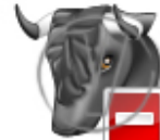
Bull Market Restricted.png