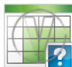
Spread Sheet Green Help.png