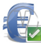
Sign Euro - Blue Check.png