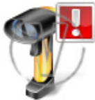
Barcode Scanner Error.png