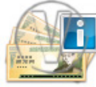
Money Yen Singles Information.png