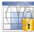
Spread Sheet Blue Security.png