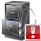
Accounting Records Error.png