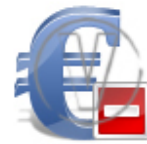
Sign Euro - Blue Restricted.png