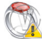
Assets Personal Warning.png