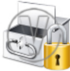
Safety Deposit Box Security.png