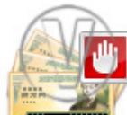
Money Yen Singles Stop.png