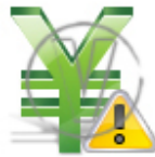
Sign Yen - Green Warning.png