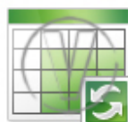
Spread Sheet Green Refresh.png