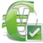
Sign Euro - Green Check.png