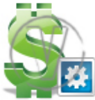
Sign Dollar - Green Configuration.png