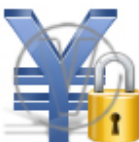
Sign Yen - Blue Security.png