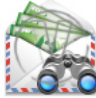
Petty Cash Find.png