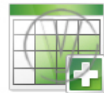
Spread Sheet Green Add.png