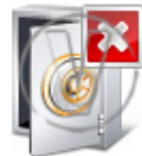
Bank Vault Delete.png