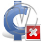
Sign Cent - Blue Delete.png