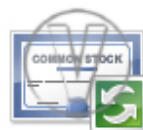
Stock Certificate Refresh.png