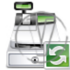
Cash Register Refresh.png