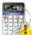
Calculator Accounting Warning.png