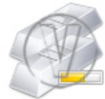
Silver Bars Progress.png