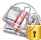
Money Pound Stack Security.png