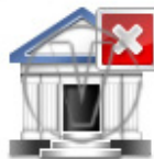
Bank Regional Office Delete.png