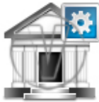
Bank Head Office Configuration.png