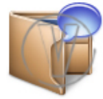
Personal Finances Chat.png