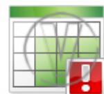
Spread Sheet Green Error.png