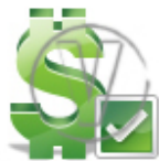
Sign Dollar - Green Check.png