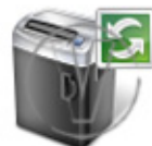
Paper Shredder Refresh.png