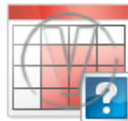
Spread Sheet Red Help.png