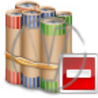
Coin Rolls Restricted.png