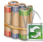
Coin Rolls Refresh.png