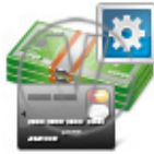
Settlement Method Configuration.png