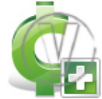
Sign Cent - Green Add.png