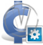
Sign Cent - Blue Configuration.png