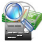
Settlement Method Search.png