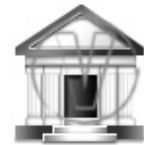
Bank Head Office.png