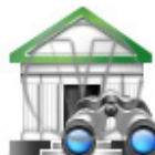
Bank Branch Find.png