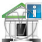
Bank Branch Information.png