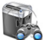
Paper Shredder Find.png