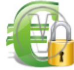
Sign Euro - Green Security.png