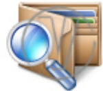
Personal Finances Search.png