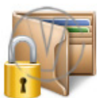
Personal Finances Security.png