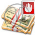
Money Yen Stack Stop.png