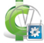
Sign Cent - Green Configuration.png