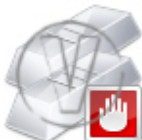
Silver Bars Stop.png