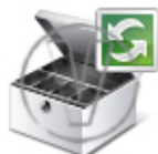
Money Drawer Refresh.png