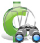
Sign Cent - Green Find.png