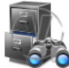
Accounting Records Find.png