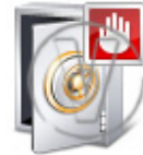
Bank Vault Stop.png