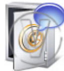
Bank Vault Chat.png