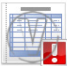
Purchase Order Error.png