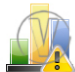
Chart Bar Warning.png