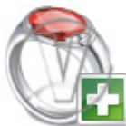
Assets Personal Add.png