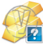
Gold Bars Help.png