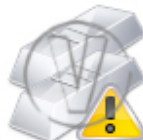
Silver Bars Warning.png