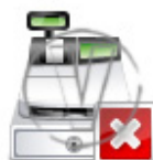
Cash Register Delete.png