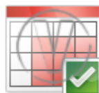
Spread Sheet Red Check.png