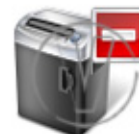
Paper Shredder Restricted.png