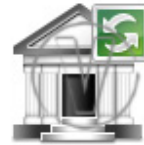
Bank Head Office Refresh.png