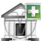
Bank Head Office Add.png