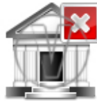
Bank Head Office Delete.png