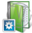
General Ledger Configuration.png