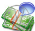
Money USD Stack Chat.png