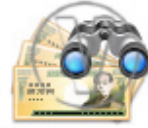
Money Yen Singles Find.png