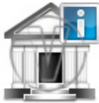
Bank Head Office Information.png