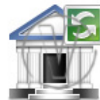
Bank Regional Office Refresh.png