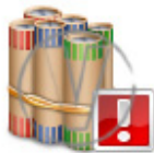
Coin Rolls Error.png