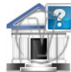
Bank Regional Office Help.png