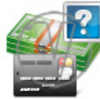
Settlement Method Help.png