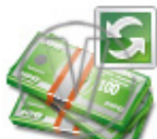
Money USD Stack Refresh.png