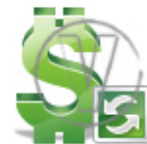
Sign Dollar - Green Refresh.png