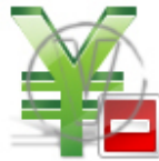
Sign Yen - Green Restricted.png