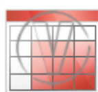
Spread Sheet Red.png