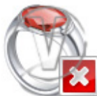
Assets Personal Delete.png