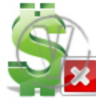
Sign Dollar - Green Delete.png