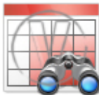
Spread Sheet Red Find.png