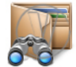
Personal Finances Find.png