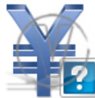
Sign Yen - Blue Help.png