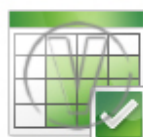
Spread Sheet Green Check.png