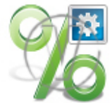
Sign Percentage - Green Configuration....