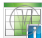
Spread Sheet Green Information.png