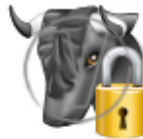
Bull Market Security.png