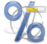
Sign Percentage - Blue Progress.png