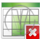
Spread Sheet Green Delete.png