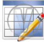
Spread Sheet Blue Edit.png