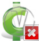
Sign Cent - Green Delete.png