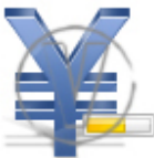
Sign Yen - Blue Progress.png