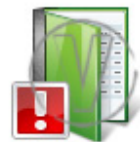
General Ledger Error.png