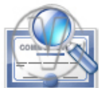
Stock Certificate Search.png