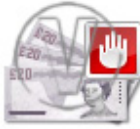
Money Pound Singles Stop.png