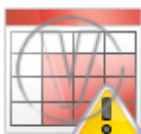
Spread Sheet Red Warning.png