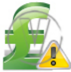
Sign Pound - Green Warning.png