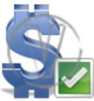
Sign Dollar - Blue Check.png