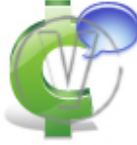
Sign Cent - Green Chat.png