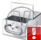
Safety Deposit Box Error.png