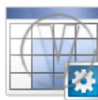
Spread Sheet Blue Configuration.png