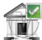
Bank Head Office Check.png