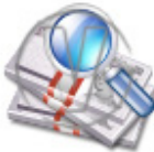
Money Pound Stack Search.png