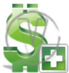
Sign Dollar - Green Add.png