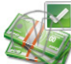
Money USD Stack Check.png