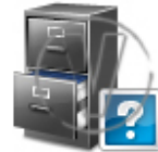
Accounting Records Help.png