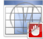
Spread Sheet Blue Stop.png