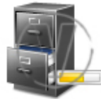
Accounting Records Progress.png