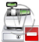
Cash Register Restricted.png