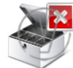
Money Drawer Delete.png