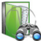
General Ledger Find.png