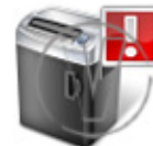
Paper Shredder Error.png