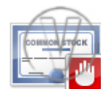
Stock Certificate Stop.png