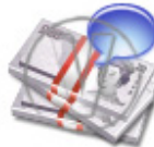
Money Pound Stack Chat.png