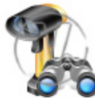
Barcode Scanner Find.png