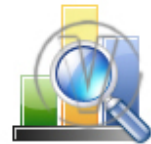
Chart Bar Search.png