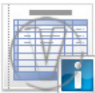
Purchase Order Information.png