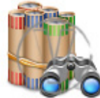
Coin Rolls Find.png