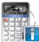
Calculator Accounting Information.png