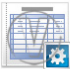
Purchase Order Configuration.png