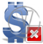
Sign Dollar - Blue Delete.png