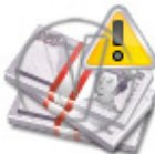
Money Pound Stack Warning.png