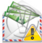
Petty Cash Warning.png