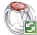
Assets Personal Refresh.png