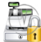
Cash Register Security.png