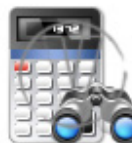
Calculator Accounting Find.png