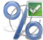
Sign Percentage - Blue Check.png