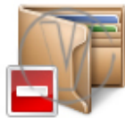
Personal Finances Restricted.png