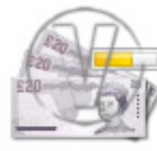
Money Pound Singles Progress.png