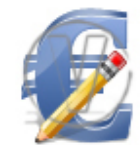
Sign Euro - Blue Edit.png