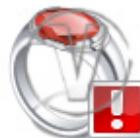
Assets Personal Error.png