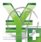
Sign Yen - Green Add.png