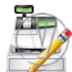
Cash Register Edit.png