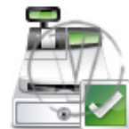
Cash Register Check.png