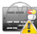
Credit Card Black Warning.png