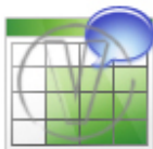
Spread Sheet Green Chat.png