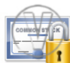
Stock Certificate Security.png