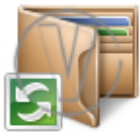
Personal Finances Refresh.png