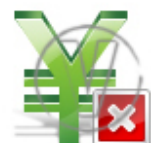
Sign Yen - Green Delete.png