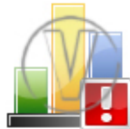
Chart Bar Error.png