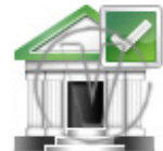
Bank Branch Check.png