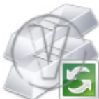
Silver Bars Refresh.png