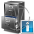
Accounting Records Information.png