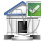
Bank Regional Office Check.png