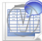
Purchase Order Chat.png