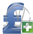
Sign Pound - Blue Add.png