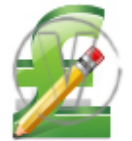
Sign Pound - Green Edit.png