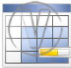
Spread Sheet Blue Progress.png