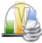
Chart Bar Accounting.png