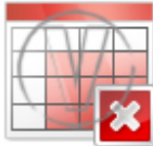
Spread Sheet Red Delete.png