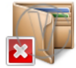
Personal Finances Delete.png