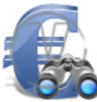
Sign Euro - Blue Find.png