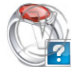
Assets Personal Help.png