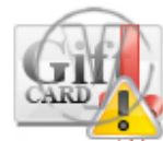
Gift Card Warning.png