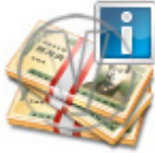
Money Yen Stack Information.png