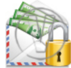
Petty Cash Security.png