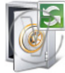
Bank Vault Refresh.png