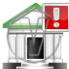
Bank Branch Error.png