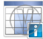
Spread Sheet Blue Information.png