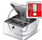
Money Drawer Error.png