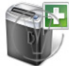
Paper Shredder Add.png