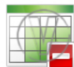
Spread Sheet Green Restricted.png