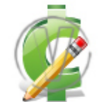
Sign Cent - Green Edit.png