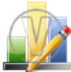
Chart Bar Edit.png