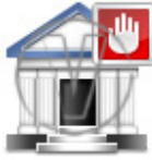
Bank Regional Office Stop.png