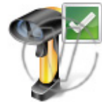
Barcode Scanner Check.png