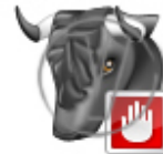
Bull Market Stop.png