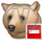
Bear Market Restricted.png