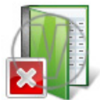
General Ledger Delete.png