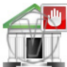
Bank Branch Stop.png