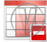
Spread Sheet Red Restricted.png