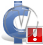
Sign Cent - Blue Error.png