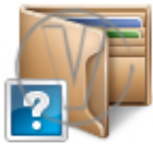
Personal Finances Help.png