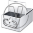
Safety Deposit Box.png