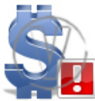
Sign Dollar - Blue Error.png